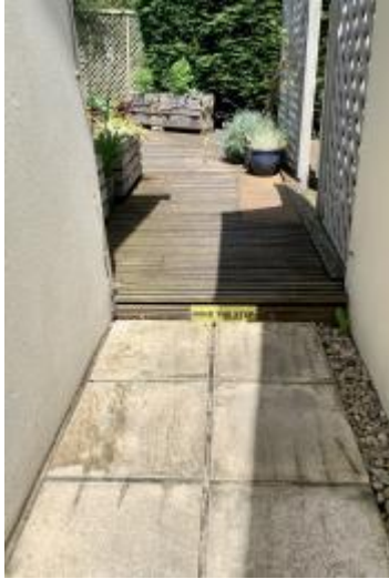
Main pathway to rear showing 10cm step