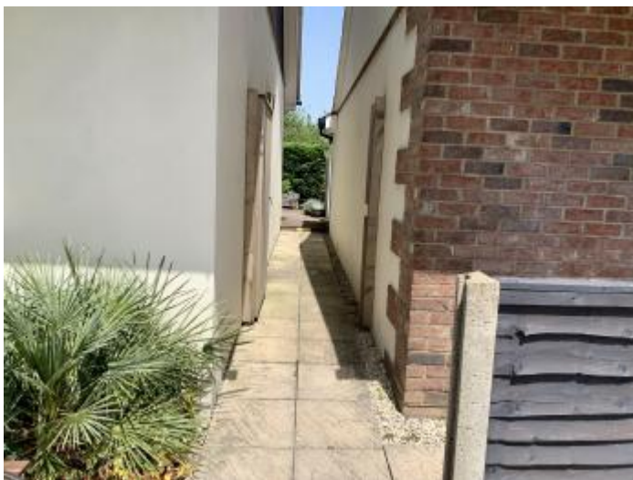
Guest pathway to guest rooms(Chidham, Garden and Sail Loft), garden terrace and breakfast room