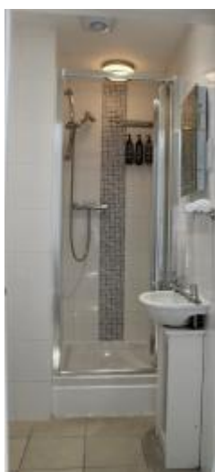
Apuldram shower and sink