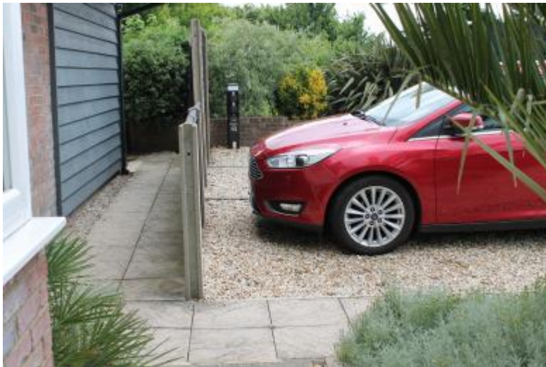
View of parking bay and pathway to the Apuldram guest room.